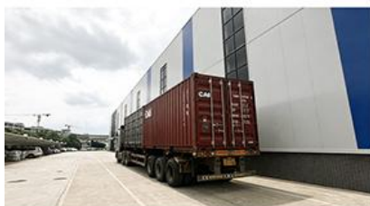
Ready for shipping