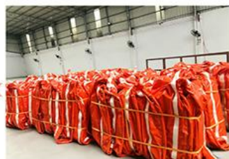
Packing & Loading